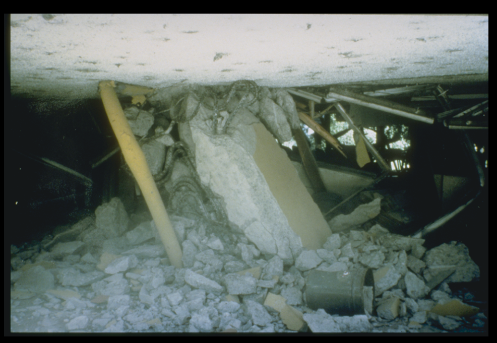
Economics and Science Building, National University, San Salvador, following 1986 earthquake.

-Preparation/Recovery: territorial issues, training, understanding of social response to hazards, long-term action