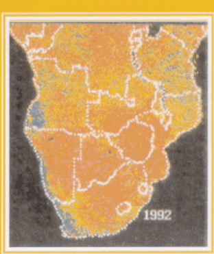
Early Warning Systems for Drought Preparedness and Drought Management